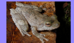
LITORIA EUCNEMIS FAMILY HYLIDAE