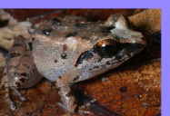
PLATYANTIS CHEESMANAE FAMILY RANIDAE