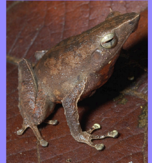
SPHENOPHYRNE CORNUTA FAMILY MICROHYLIDAE