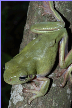
LITORIA CAERULEA FAMILY HYLIDAE