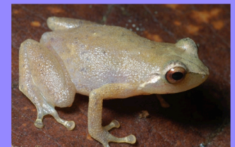
OREOPHYRNE BIROI FAMILY MICROHYLIDAE