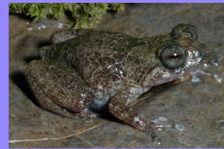
AUSTROCHAPERINA PALMIPES FAMILY MICROHYLIDAE