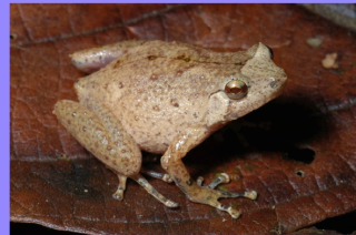
COPIXALUS SALBUS FAMILY MICROHYLIDAE