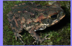
BUFO MARINUS FAMILY BUFONIDAE -INTROUCED-