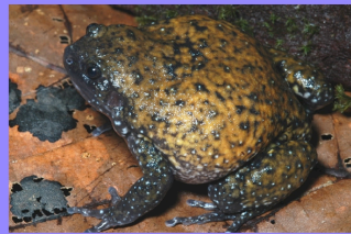
CALLULOPS DORJAE FAMILY MICROHYLIDAE