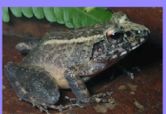
PLATYANTIS PAPUENSIS FAMILY RANIDAE