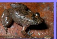
LIMNONECTES GRUNNIENSIS FAMILY RANIDAE