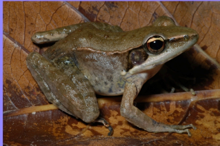
RANA GRISEA FAMILY RANIDAE