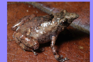
CHEROPHYRNE ROSTELLIFER FAMILY MICROHYLIDAE