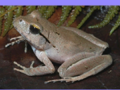
LECHRIODUS MELANOPYGA FAMILY MYOBATRACHIDAE