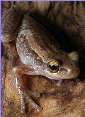
LITORIA RUBELLA FAMILY HYLIDAE