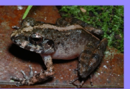
PLATYANTIS PAPUENSIS FAMILY RANIDAE