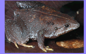
XENOBATRACHUS SP. FAMILY MICROHYLIDAE