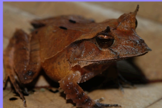
CERATOBATRACHUS GUENTHERI FAMILY RANIDAE