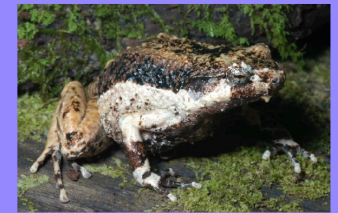
MANTOPHYRNE LATERALIS FAMILY MICROHYLIDAE