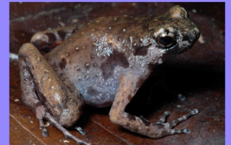
HYLOPHORUS RUFESCENS FAMILY MICROHYLIDAE