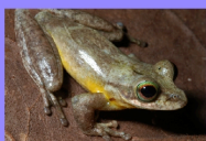
LITORIA THESAURENSIS FAMILY HYLIDAE