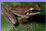
LITORIA IMPUBA FAMILY HYLIDAE