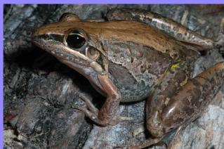
LITORIA NARUTA FAMILY HYLIDAE