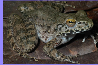
RANA ARFAKI FAMILY RANIDAE