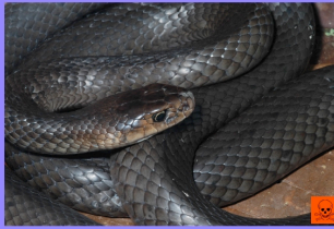
EASTERN OR COMMON BROWN SNAKE (PSEUDONAJA TEXTILIS) FAMILY ELAPIDAE (HIGHLY VENOMOUS: BIKPELA POISON)