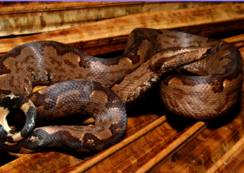
PACIFIC BOA OR LAZI SNAKE (CANODIA CARINATA) FAMILY BOIDAE