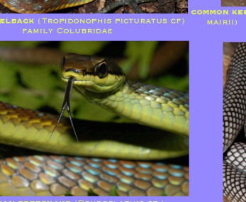
PAPUAN TREESNAKE (DENDRELAPHIS SP.) FAMILY COLUBRIDAE