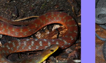
PAINTED KEELBACK (TROPIDONOPHIS PICTURATUS SP) FAMILY COLUBRIDAE