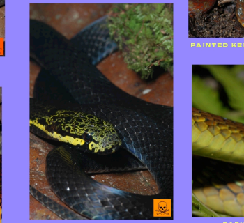
MULLER'S CROWNED SNAKE (ASPIDOMORPHUS MUELLERI) FAMILY ELAPIDAE (VENOMOUS POTENTIALLY DANGEROUS)