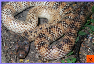
NEW GUINEA SMALL-EYED SNAKE OR IKAHEKA SNAKE (MICROPECHIS IKAHEKA) FAMILY ELAPIDAE (HIGHLY VENOMOUS: BIKPELA POISON)