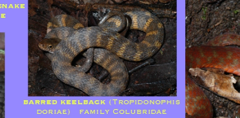
BARRED KEELBACK (TROPIDONOPHIS DORIAE) FAMILY COLUBRIDAE