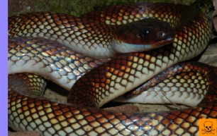
SOLOMONS CORAL SNAKE (SALOMONELAPS PAR) FAMILY ELAPIDAE (VENOMOUS POTENTIALLY DANGEROUS)