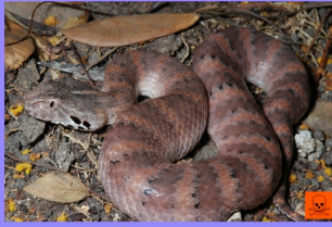
DEATH ADDER (ACANTHOPIUS LARVIE) FAMILY ELAPIDAE (HIGHLY VENOMOUS: BIKPELA POISON) COMMONLY STEPPED ON CAUSING SERIOUS INJURY RED AND BEEY COLOR PHASE OF DEATH ADDERS