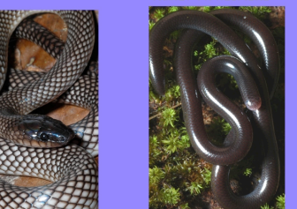
BLATEY-GREY SNAKE (STEGONOTUS CUCULLATUS) FAMILY COLUBRIDAE

LOUISIANA STATE UNIVERSITY MUSEUM OF NATURAL SCIENCE (ALL RIGHTS RESERVED) CHRISTOPHER AUSTIN (CCAUSTIN@LSU.EDU) IN ASSOCIATION WITH: