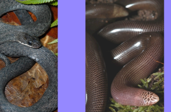
COMMON KEELBACK (TROPIDONOPHIS MAIRII) FAMILY COLUBRIDAE