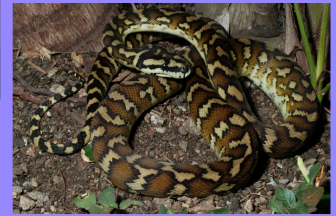
CARPET PYTHON (MORELIA SPILOTA) FAMILY PYTHONIDAE