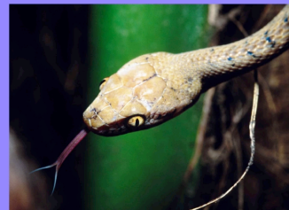
BROWN TREE SNAKE (BOIGA IRREGULARIS) FAMILY COLUBRIDAE