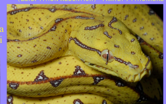
GREEN TREE PYTHON (MORELIA VIRIDIS) JUVENILE FAMILY PYTHONIDAE