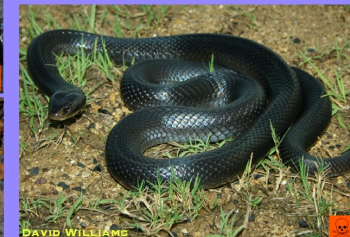
PAPUAN BLACKSNAKE (PSEUDECHIS PAPUANUS) FAMILY ELAPIDAE (HIGHLY VENOMOUS: BIKPELA POISON)