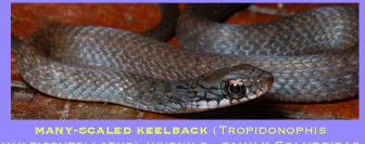
MANY-SCALED KEELBACK (TROPIDONOPHIS MULTISCUPELLATUS) JUVENILE FAMILY COLUBRIDAE