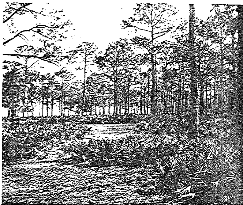
FIGURE 1. View of Deer Island Showing Open Pine Woodland

The three coastal counties of Mississippi are representative of the coastal plain that borders the Gulf of Mexico from the Atlantic coast westward into Texas. The topography is level to gently rolling, with an elevation of approximately 20 feet above sea level at the highest point. On the mainland there existed originally an almost unbroken stretch of open forest in which the principal species was the longleaf pine ( Pinus palustris ). At the present time very little of the original forest remains, unrestricted logging