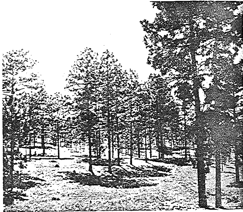
FIGURE 3. Typical Open Growth Longleaf Pine on Mainland

entirely by the slash pine. On both Petit Bois Island and Horn Island, each 16 miles from the mainland, there are but few live oaks, whereas on Ship Island and Cat Island, there are numerous groves of these trees. On Deer Island the live oak reaches a size equal to that attained on the mainland and is well distributed over the island. Deer Island is readily accessible since at its closest point it lies less than a mile offshore. It has been inhabited for many years by several families that live at the extreme western