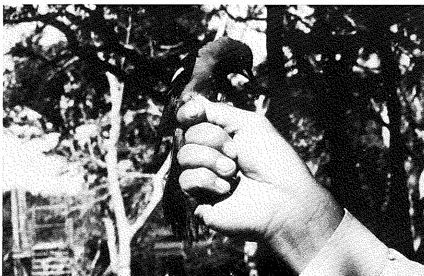
Hooded Oriole ( Icterus cucullatus ) Holleyman Migratory Bird Sanctuary, Peveto Beach, Cameron Parish, LA on 20 April 1987. Top photograph by Howard Kisner, bottom photograph by the authors.